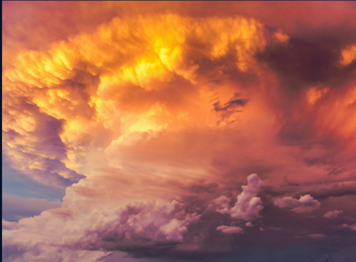
Windstorm coverage – North American client